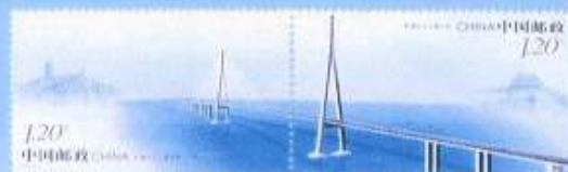
2008-8 苏通长江公路大桥 Sutong Bridge