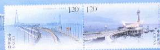
2009-11 杭州湾跨海大桥 Hangzhou Bay Bridge